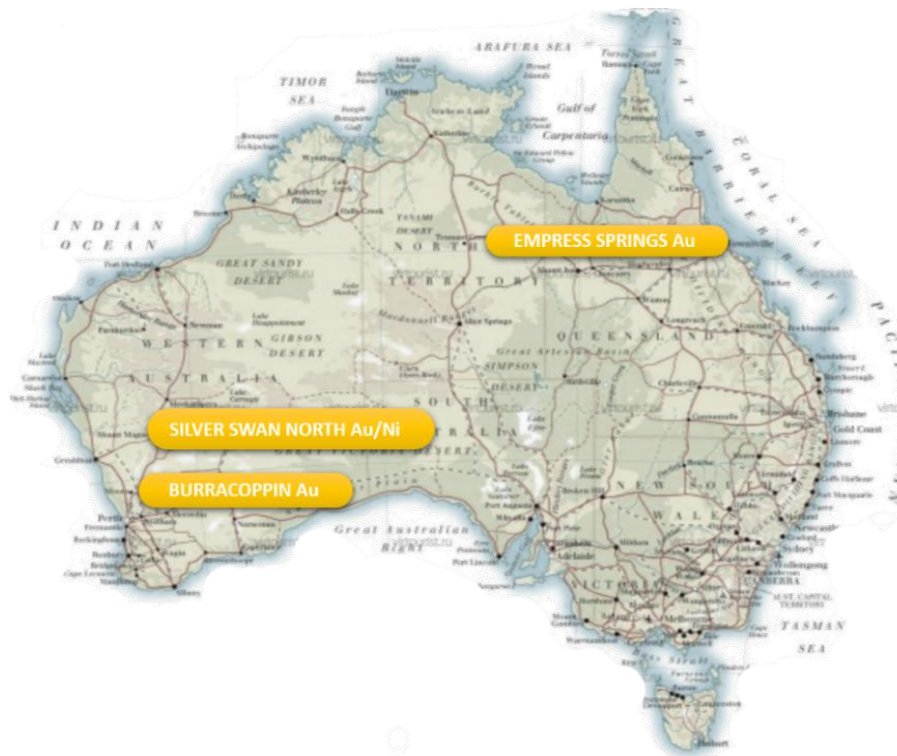
Moho's project areas

Moho Resources Ltd is an Australian mining company which listed on the ASX in November 2018. The Company is focused on gold and nickel exploration at Empress Springs, Silver Swan North and Burracoppin.