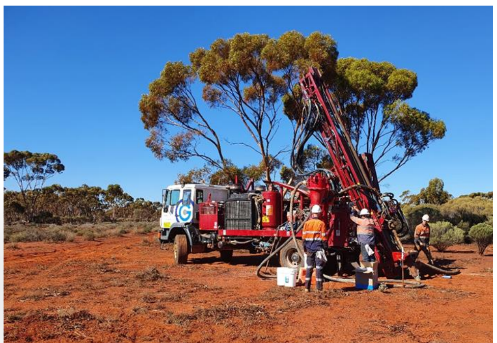
Figure 1: Aircore drilling in progress at Hodges prospect (M27/488)