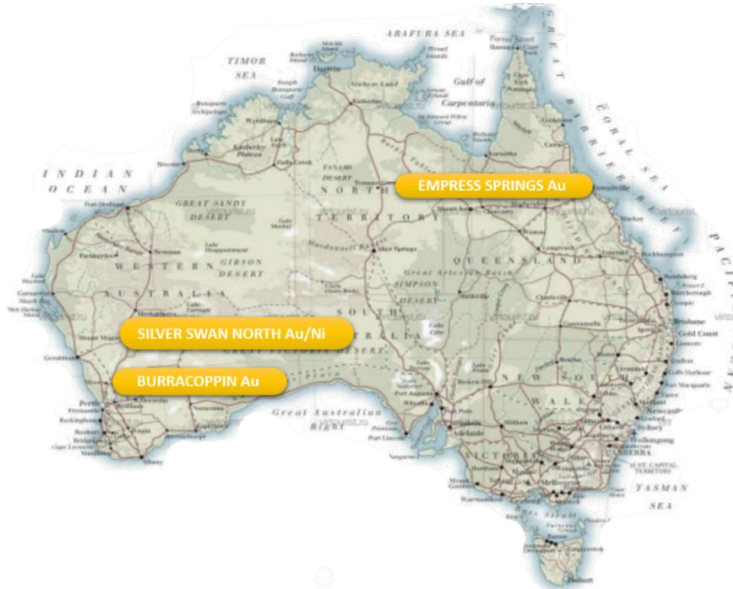
MAP OF MOHO's PROJECT AREAS

Moho Resources Ltd is an Australian mining company which listed on the ASX in November 2018. The Company is focused on gold and nickel exploration at Empress Springs, Silver Swan North and Burracoppin.